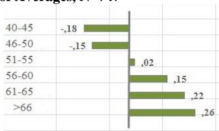
Figure 2 Workplace Discrimination Index Z Scale, Comparison of Averages, N=747